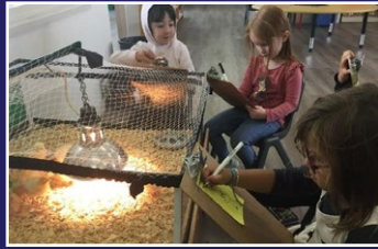
Children learn to interact in relation to the chicks with care, empathy and respect.

Their top questions are; How many are going to be hens? How many are going to be roosters? And... What are their names going to be?... We will have to wait and see!