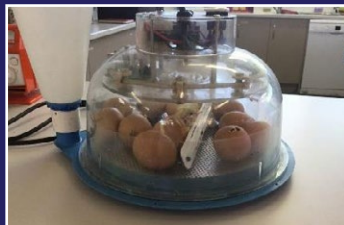
Children are connecting with, contributing to and learning about their world. They are being given opportunities to show; social responsibility and care for the baby chicks.